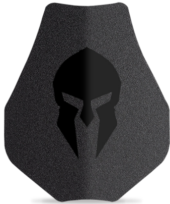
10" x 12" Single Curve High Mobility Cut BASE COAT: SA-500-10 X 12 SW SC BC FULL COAT: SA-500-10 X 12 SW SC FC