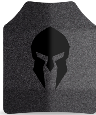
10" x 12" Advanced Triple Curve® (ATC®) Shooters Cut BASE COAT: SA-500-10 X 12 SH ATC BC FULL COAT: SA-500-10 X 12 SH ATC FC