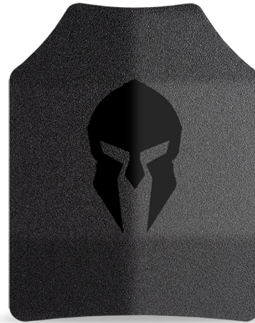
11" x 14" Advanced Triple Curve® (ATC®) Shooters Cut BASE COAT: SA-500-11 X 14 SH ATC BC FULL COAT: SA-500-11 X 14 SH ATC FC