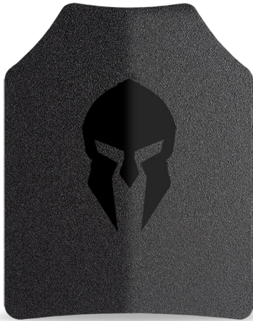
11" x 14" Single Curve Shooters Cut BASE COAT: SA-500-11 X 14 SH SC BC FULL COAT: SA-500-11 X 14 SH SC FC