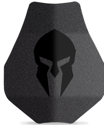
10" x 12" Advanced Triple Curve® (ATC®) High Mobility Cut BASE COAT: SA-500-10 X 12 SW ATC BC FULL COAT: SA-500-10 X 12 SW ATC FC