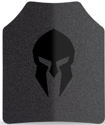
10" x 12" Single Curve Shooters Cut BASE COAT: SA-500-10 X 12 SH SC BC FULL COAT: SA-500-10 X 12 SH SC FC